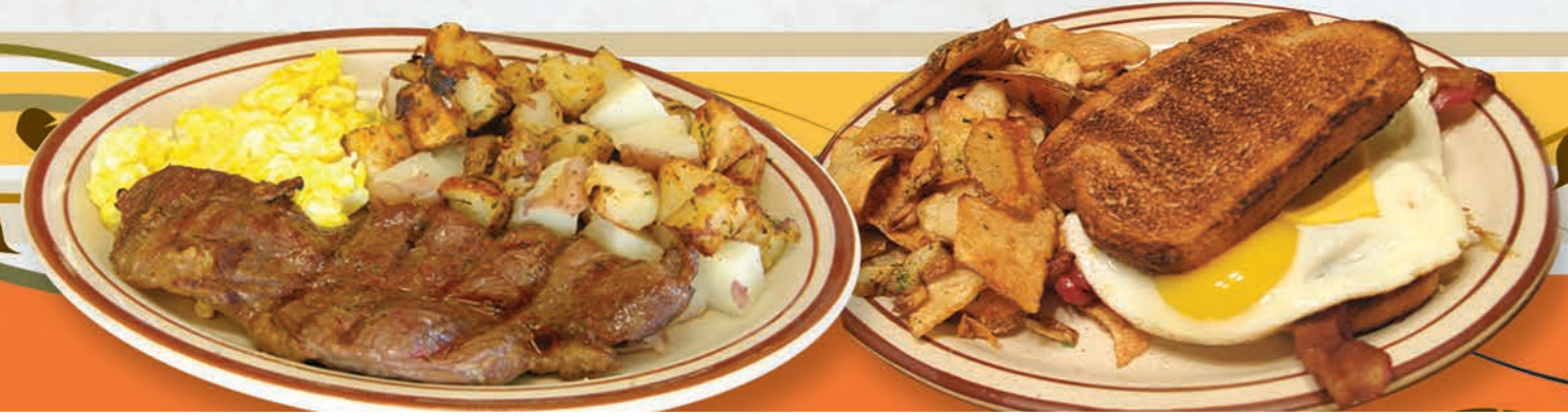
Photos are for illustrative purposes only and actual items served may differ from the photos presented.