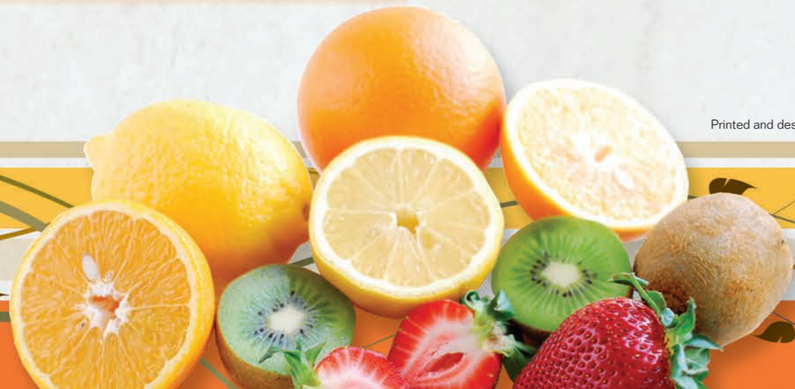
Photos are for illustrative purposes only and actual items served may differ from the photos presented.

Printed and designed by Excel 1-800-734-3044